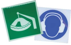
IDIGO Safety Sign